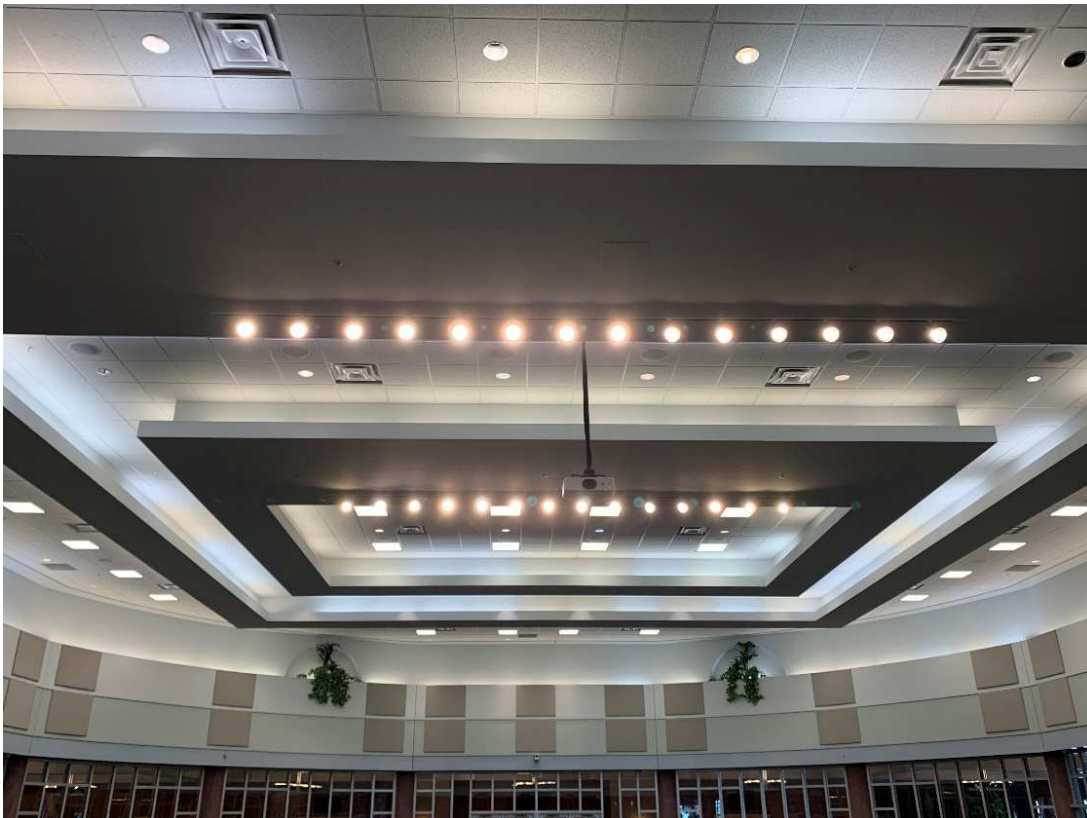
Sample of Garden Room Lights