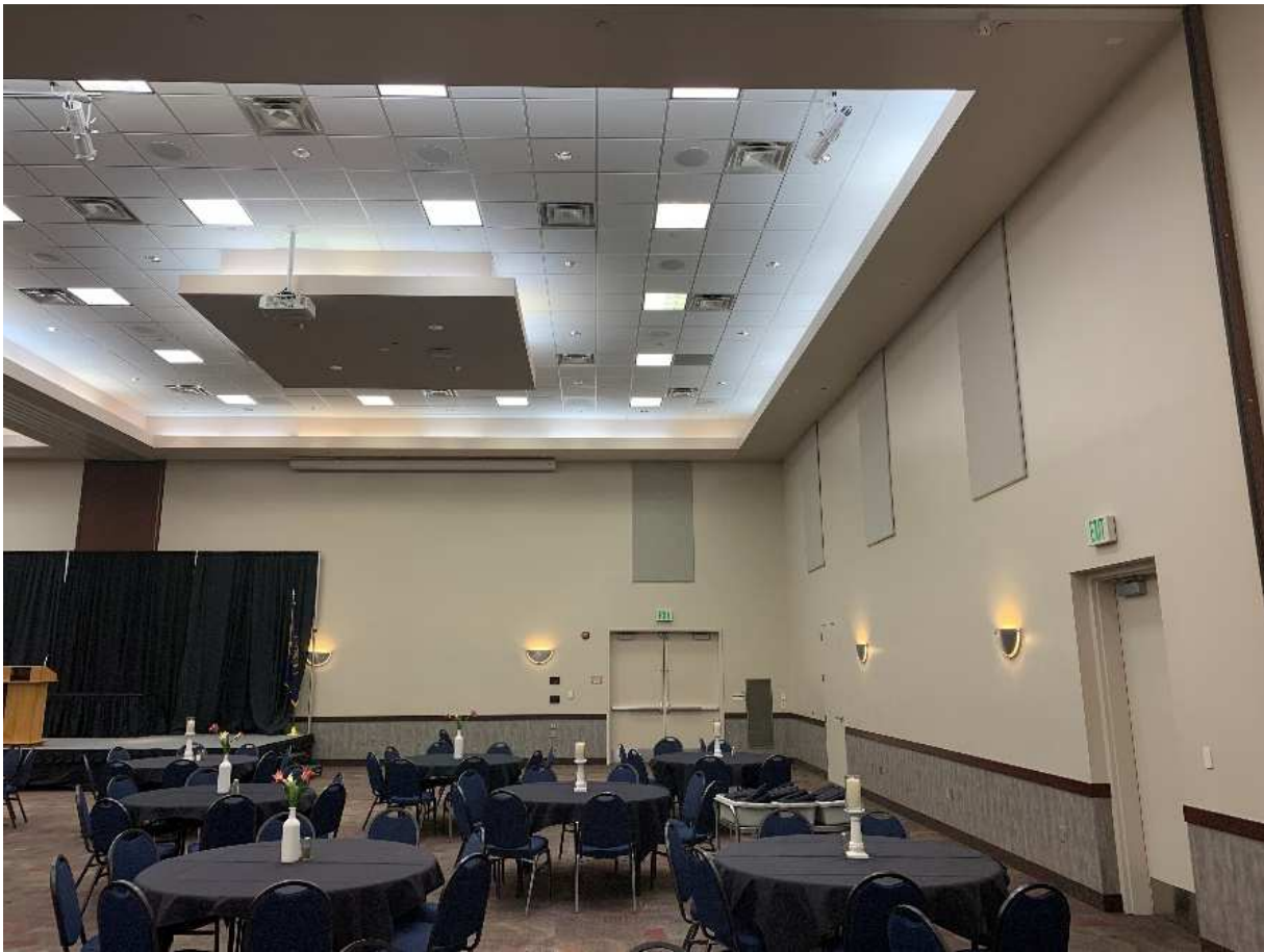
Sample of Ballroom Lighting