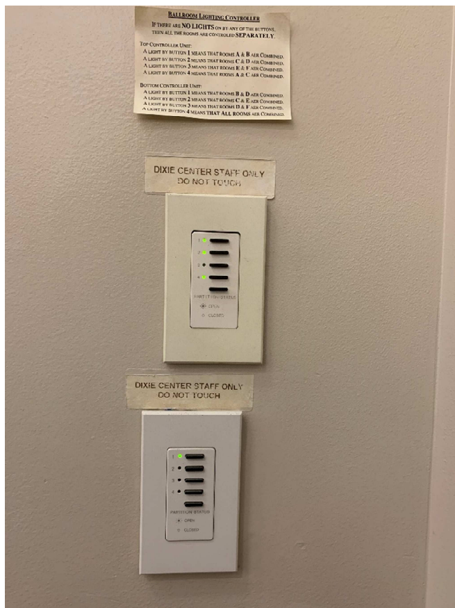
Manual room combiner