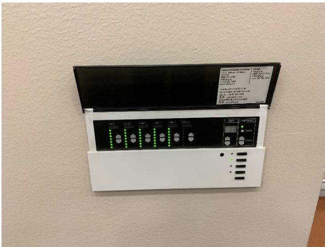
Sample of programmable Lutron light switch