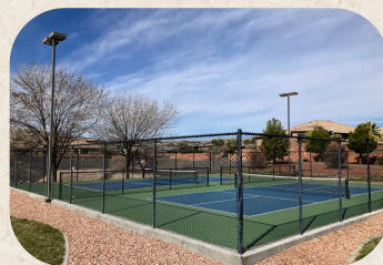
Pickleball Courts Washington