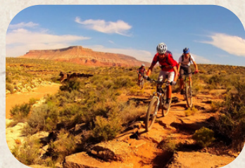
Jem Trail Hurricane