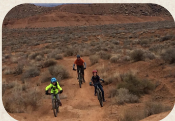
Bearclaw Poppy Trail St. George