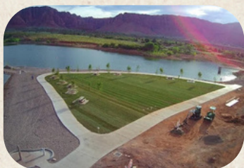
Fire Lake Park Ivins