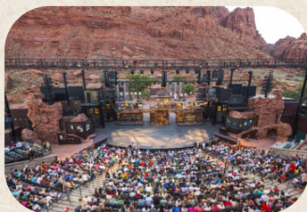
Tuacahn Center for the Arts Ivins