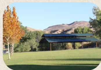
Riverwood Pavilion La Verkin