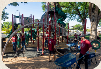
Veteran's Park Washington City