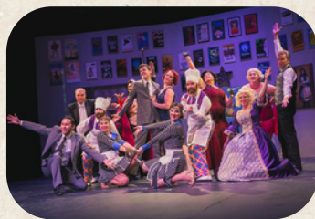
Hurricane Theatrical Hurricane