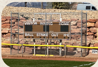
Baseball Complex Washington City