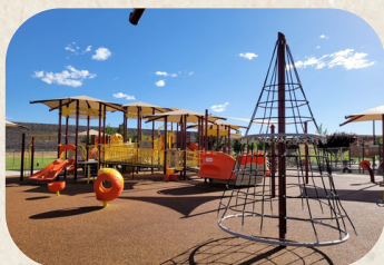
All-Inclusive Park Hurricane