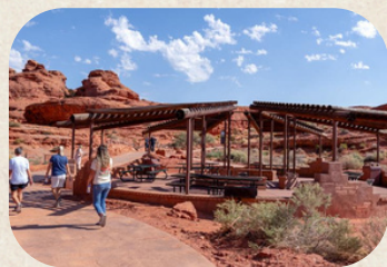
Pioneer Park Trail St. George