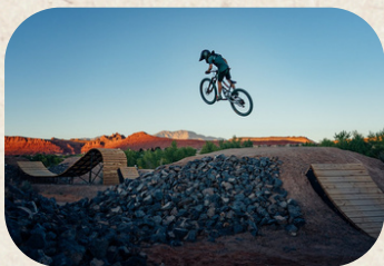
Snake Hollow Bike Park St. George