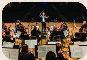
Southwest Symphony Hurricane