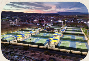
Little Valley Pickleball Complex St. George