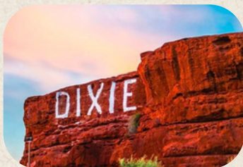
Dixie Rock Trail Hurricane