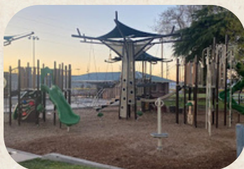
Canyon View Playground Santa Clara