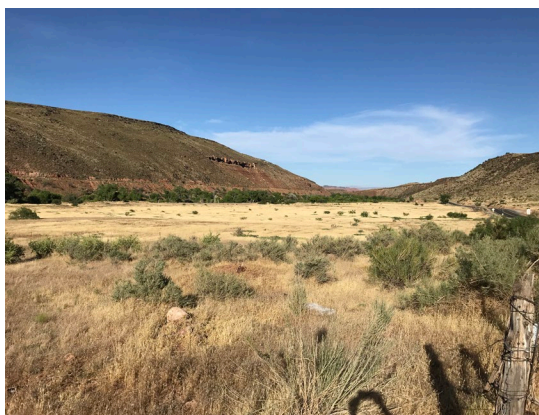
Photo of Shivwits Reservation Land

*For those who are unable to attend the meeting and would like to meet with the NRCS and/or Washington County to discuss the project, arrangements may be made upon request.