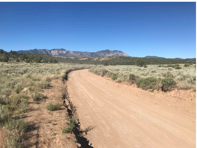
Utah State Office